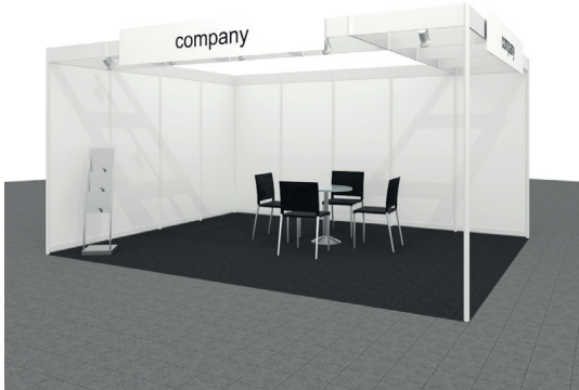
Your individual booth